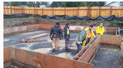
Building in the Pacific Northwest ... rain happens.