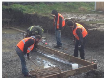
YouthBuild students laying the foundation for the next house.