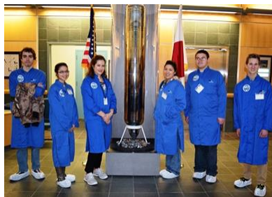
Exploring the wafer creation process at SEH America.