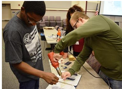
Students build portable solar batteries at the Cowlitz Public Utilities District (PUD).