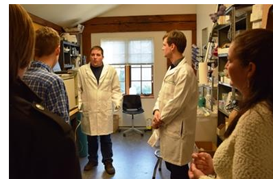
Learning about education pathways by hearing personal experiences at CID Bio-Science.