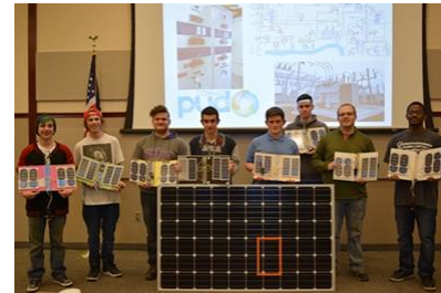
Showing off completed portable solar batteries at Cowlitz PUD.