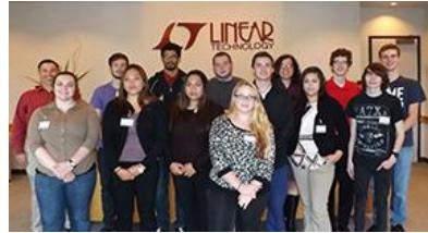
Linear Technology in Camas hosted a BAS manufacturing event