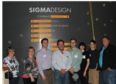
Sigma Design welcomed BAS participants to its downtown Vancouver office