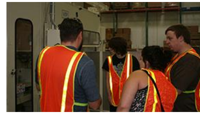
Learning how enormous roles of paper become useful household paper products at APC