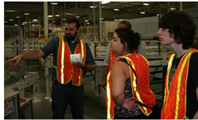
A tour of American Paper Converting in Woodland

360.567.1070 360.567.1054 Fax www.swwdc.org