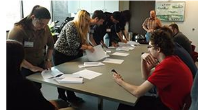
Making paper airplanes to demonstrate Lean Manufacturing