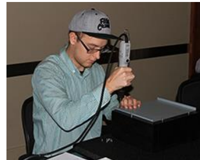
Creating and following procedures at Sigma Design