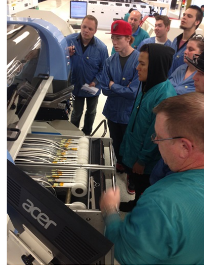
Silicon Forest Electronics