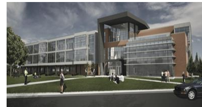
Clark College STEM Building (Rendering)