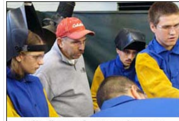
Welding "boot camp" participants observe new technique before trying it on their own

individuals pursuing training in this field. As a result, classes at local community colleges and training schools are full with adults looking for a career change or to brush up on their own welding skills, making enrollment in these classes difficult for inexperienced youth.